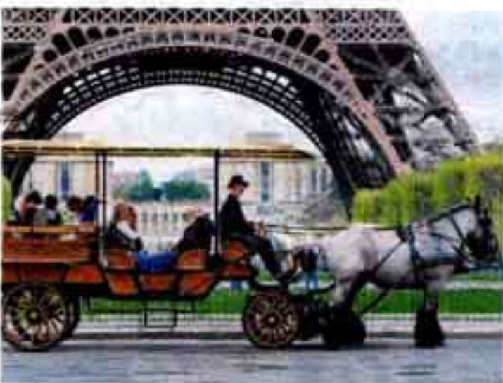
Culture vultures: Paris is on the itinerary